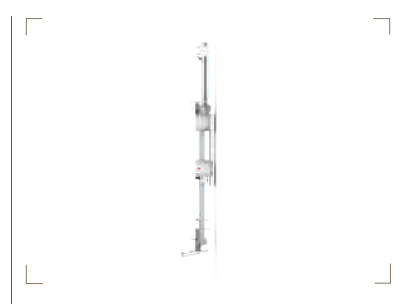
Robust attachment to wall.