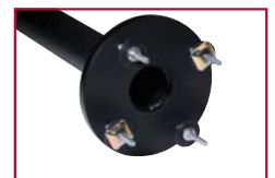
slope nuts security (shown without desktop surface)