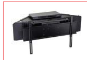
Optional shelf available for A/V components