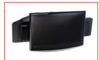
Wall units accommodate speakers when used with smaller screens

Peerless Industries, Inc. 3215 W. North Avenue, Melrose Park, IL 60160