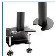
2 types of desk mounting options