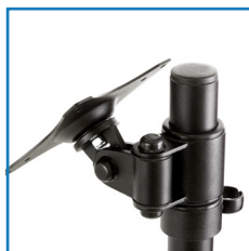
Tilt angle adjustment from -70^{\circ} to +70^{\circ}