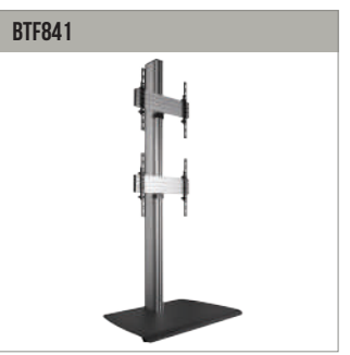
System X Dual Stack Floor Stand - 1.8m designed to mount two screens, one above the other, in portrait or landscape style