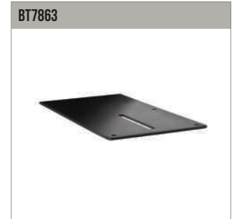
VC Camera Shelf is ideal for adding VC cameras or small media players to an installation or directly to the wall