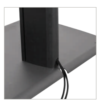
Integrated cable management for a neat and tidy installation