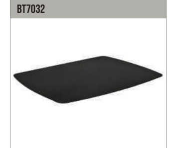
Large AV Accessory Shelf is ideal for adding AV accessories such as a Blu-Ray player or laptop to an installation or a wall