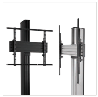
Maximum VESA fixing can be increased to 600mm using the included