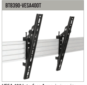
VESA 400 Interface Arms designed to mount medium / large sized screens in a tilted position