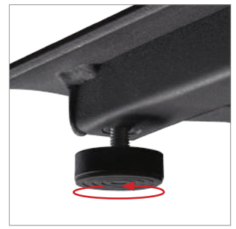
Supplied with adjustable levelling feet to accommodate uneven floor surfaces